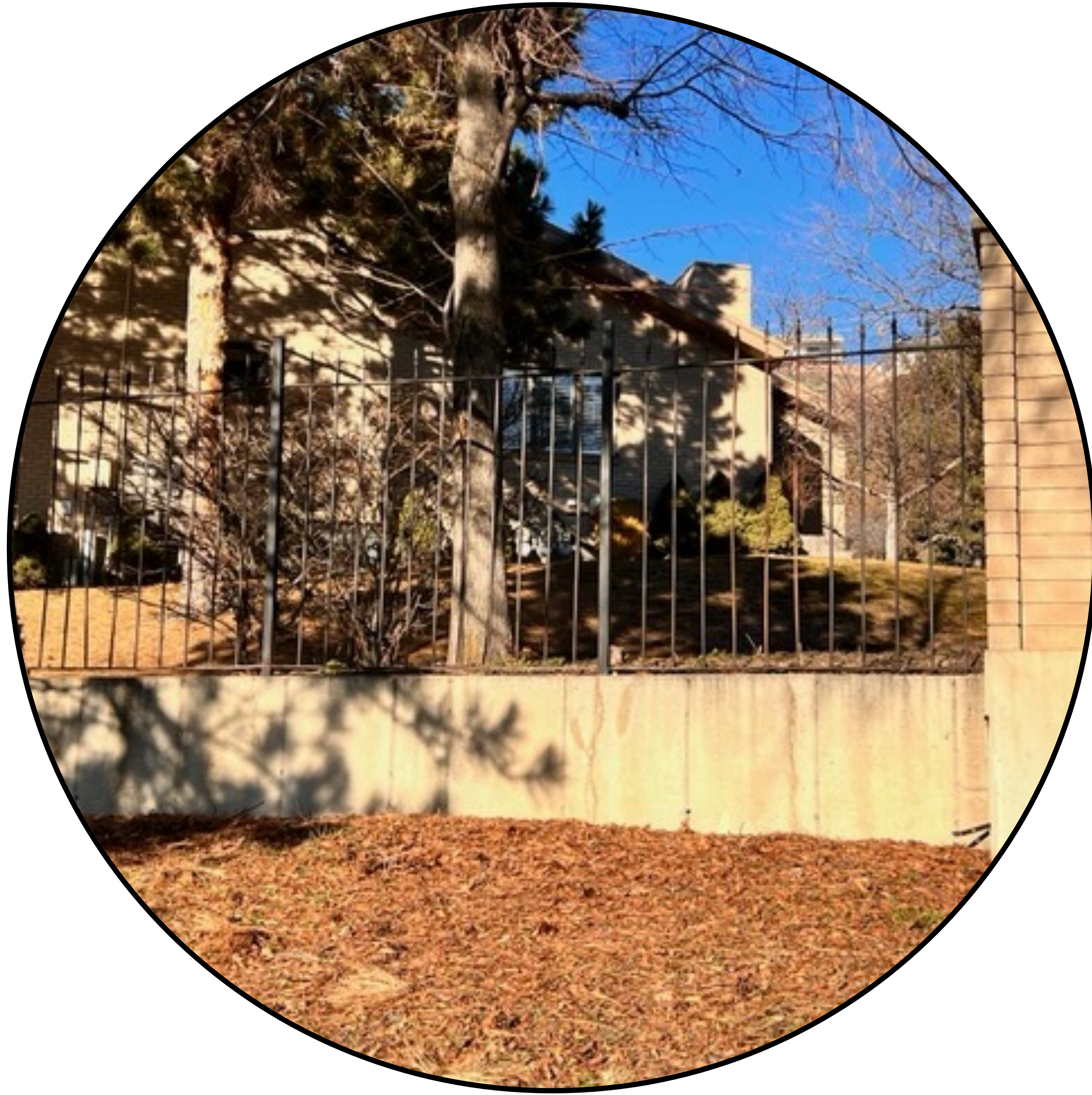
Current Boundary Wall and Fence